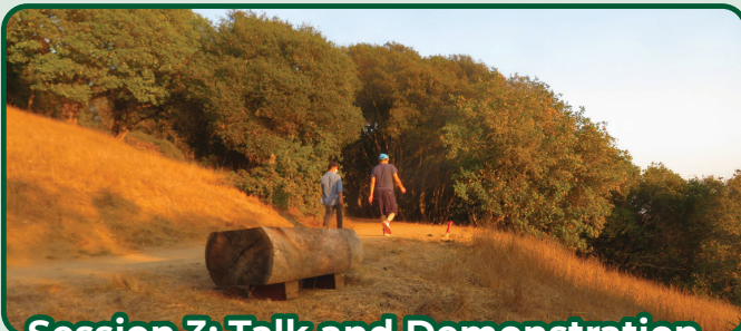
Session 3: Talk and Demonstration

Date: October 2026 (date TBD) Location: Albany Hill, Taft turnaround