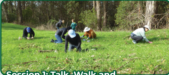
Session 1: Talk, Walk and Volunteering